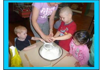
Preschoolers in the "Kitchen" baking yummy gingerbread people, mmmmm, yum, yum.